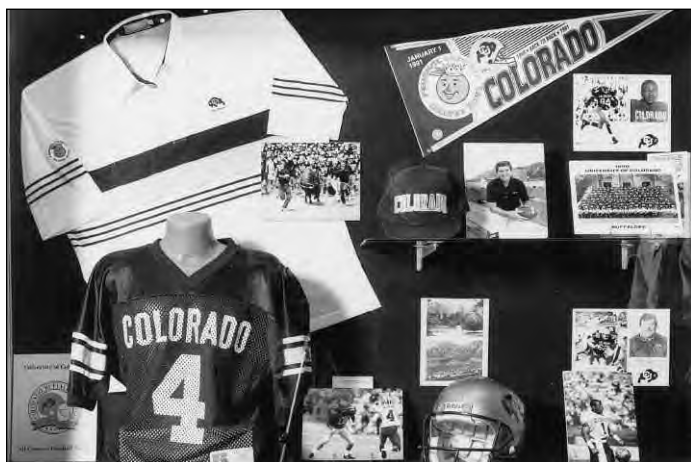
CU's National Title Display at the College Hall of Fame